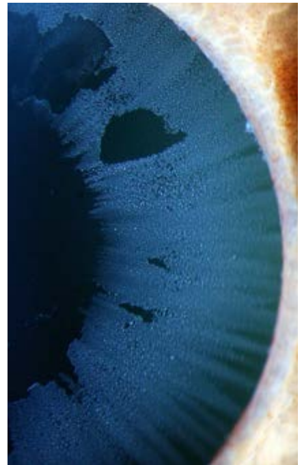
NEED FOR CAUTION. As with pseudoexfoliation glaucoma (shown here), most people who carry genetic risk factors for glaucoma never develop the disease.

carry causative variants that their risk for glaucoma is no higher than that of the general public. This has the potential to save both money and time, as these patients won't need intensive follow-up.